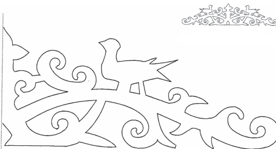
Fig. 3. Stencil-model of decorative window head, by Monika Maksimowicz [2]