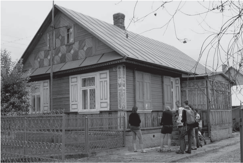
Fig. 4. Group patron's explanation concerning the precision of measurements.

the participants under supervision of professionals took pictures of landscape and architecture, individual buildings and decorative details from proper perspective.