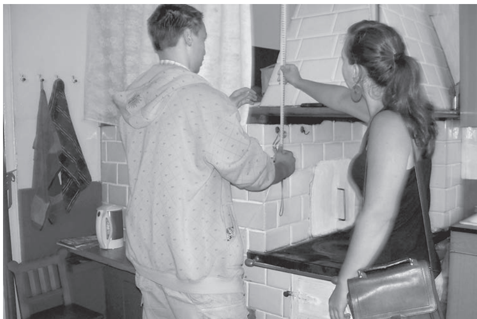
Fig. 6. Measurement of the kitchen stove, Czyże village.

measurements with the use of a tape measure and gave readings to be included in the drawings. The field sketches are an indispensable element of collecting data, and the participants were encouraged to make them. The explanations of the principles of the perspective, presentation of free-hand sketches (Fig. 1), drawing techniques, methods of application of different techniques and drawing instruments: pencil, pen and ink, charcoal proved helpful. The students were willing to present their own drawing skills and attentively listened to professional advice.