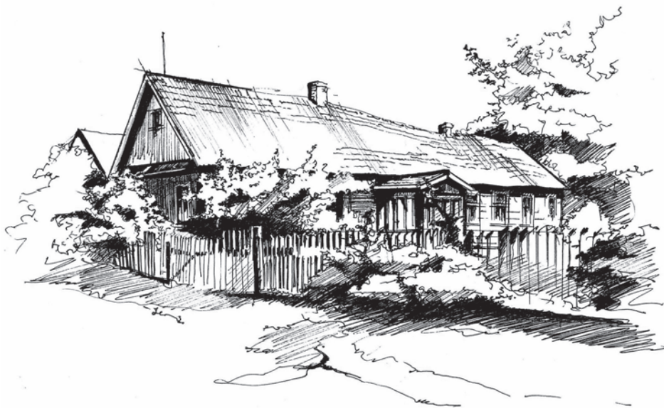
Fig. 1. Free-hand sketch of surveyed and mapped building, by Monika Maksimowicz