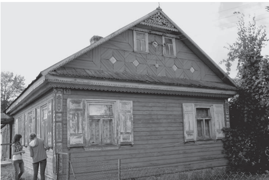
Fig. 5. Measurement of corner decorations of residential building, Czyże village.

While doing that they used the questionnaire prepared by the workshop organizer in which the most important issues were listed e.g. general data such as the name and address of the building, including their name in local dialect, date of construction, history of erection, builder and owner as well as a sketch of location of the building in the homestead, names of individual rooms, building and finishing materials, description of decorative details, information about tools and furniture. The data regarding renovations, modernizations altering the original shape were also important. Other persons were responsible for taking pictures of buildings, interiors, furniture as well as details. Still others were making an inventory note, detailing a sketch of the layout of the rooms in the building with their names, a drawing of elevations and a drawing of decorative details. Three other persons were taking