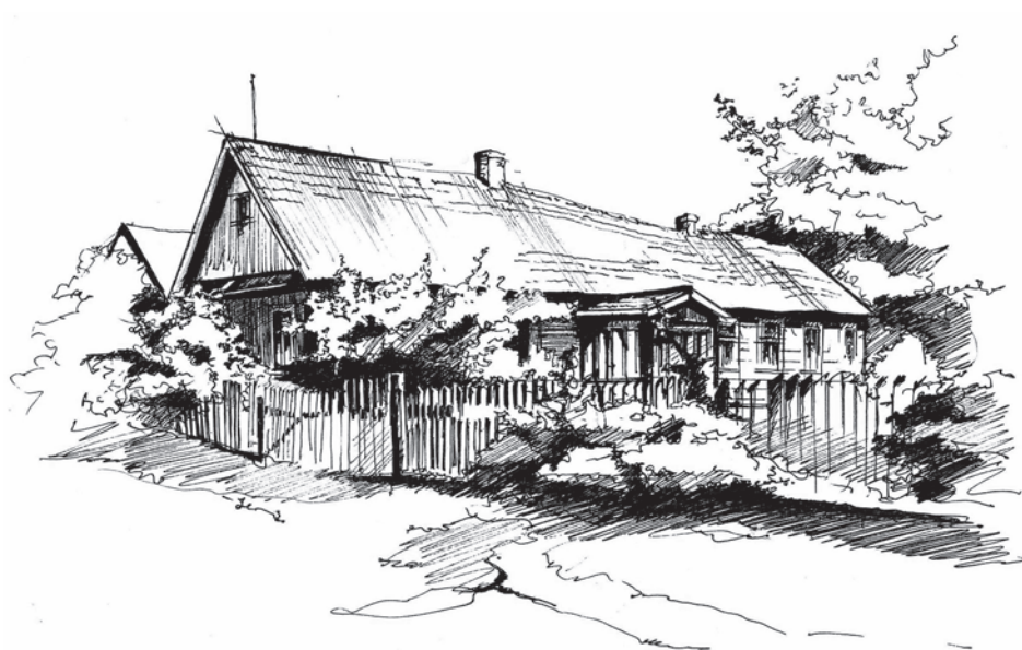
Fig. 1. Free-hand sketch of surveyed and mapped building, by Monika Maksimowicz